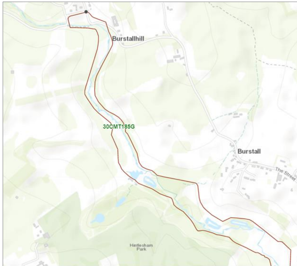
Figure 2.1: Burstall Hill Area, Land within the Consultee's remit